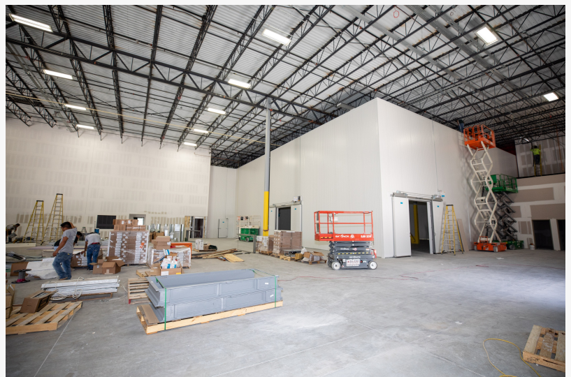
Palm Beach County Food Bank's New Facility

donations from private individuals and organizations. This new warehouse space doubles our capacity for distribution and will make it possible to meet our county's increased need for food distribution due to the pandemic and into the future. Last year, we were offered resources for distribution which we couldn't accept because we were limited by our existing infrastructure. This new warehouse space ensures we will be able to feed many more of our hungry neighbors."