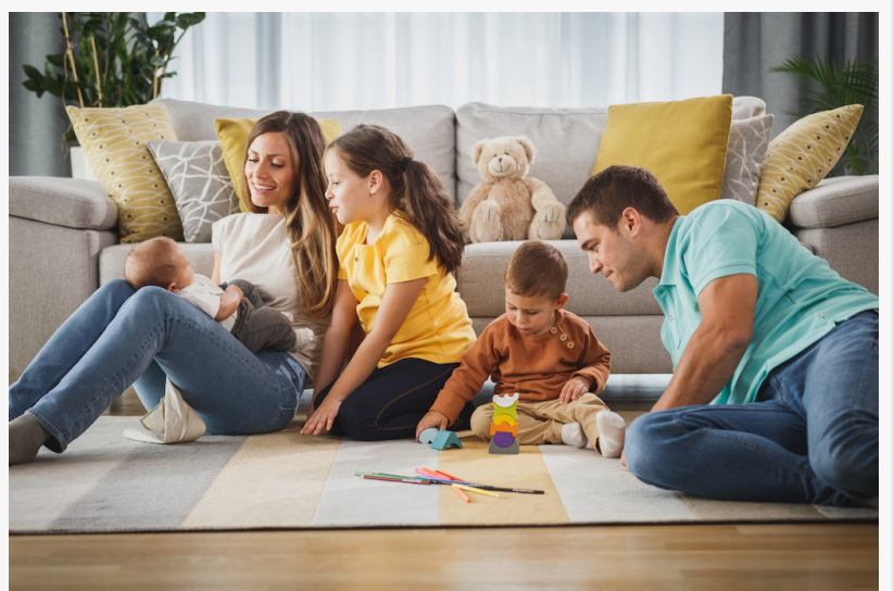
Sentinel Home 2

inGen Dynamics is an industry-leading Robotics and AI company based in Silicon Valley. Our AI-enabled Robots and products operate in many of today's most essential markets, including healthcare, education, security, safety, and service robotics. Our long-term ambition is to create a unified global platform for Robotics and AI called The Origami Platform™ (formerly Dynamix) to simplify, streamline, and improve lives.