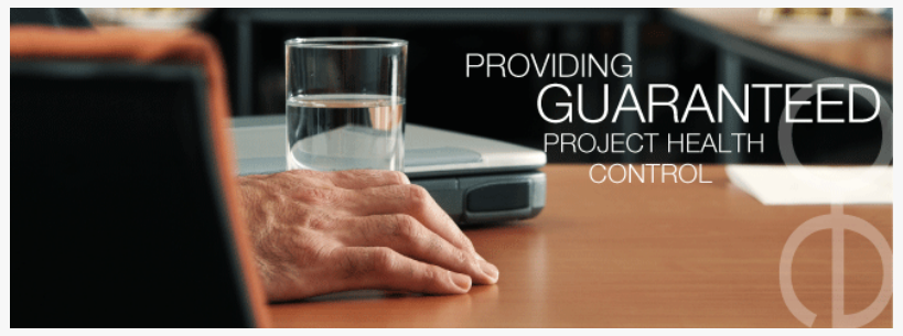
Project Health Control - A Career Path for Solution Finders

Applications for new-build single board computers though initially prioritised to schools and colleges in Essex, are welcomed from anywhere in the UK and abroad, as roll out for the supply