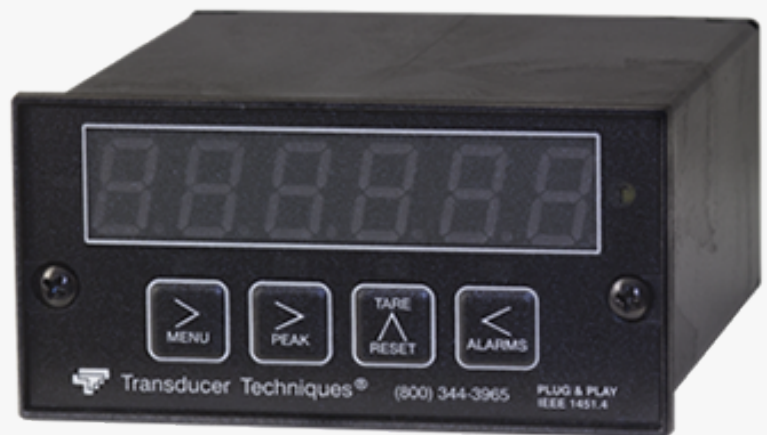
DPM-3 Load Cell Panel Meter