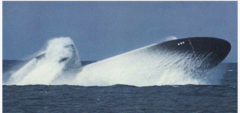
Training that will blow you out of the water