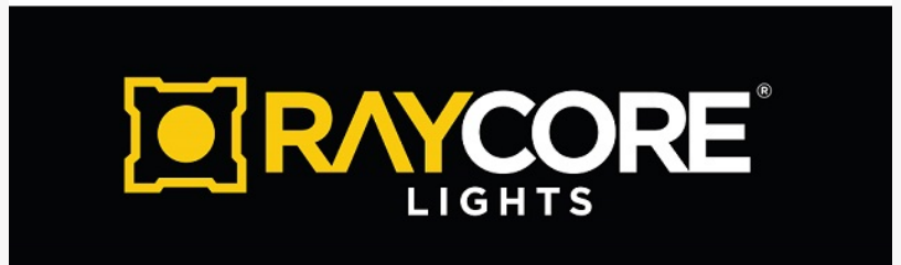
Raycore Lights and Dorian Drake Announce Strategic Alliance for Work Light Export Sales