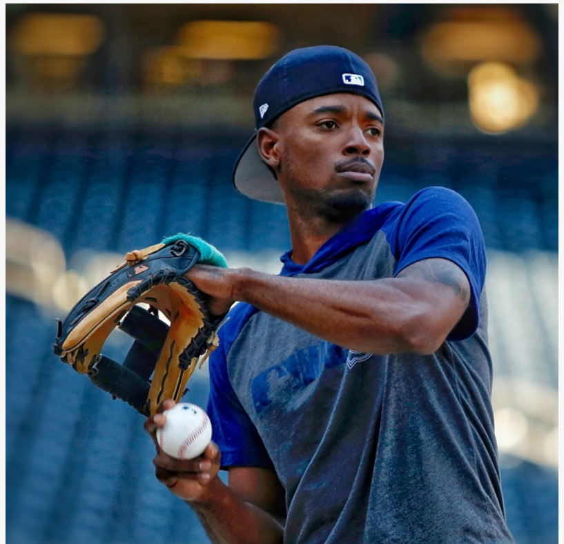
Golden Glove Award Winner, Dee Strange-Gordon Raises Money to Donate Hot Spots for Students-in-Need.

As the interview telethon unfolds, Dee Strange-Gordon will share stories of stealing 330 bases in the 2010s, the most of any player. Amidst tales of playing for the Dodgers, Marlins, and Mariners, attendees will be invited to join forces with Dee Strange-Gordon by making donations to buy hotspots to connect students-in-need around Dee's hometown of Orlando, Florida.