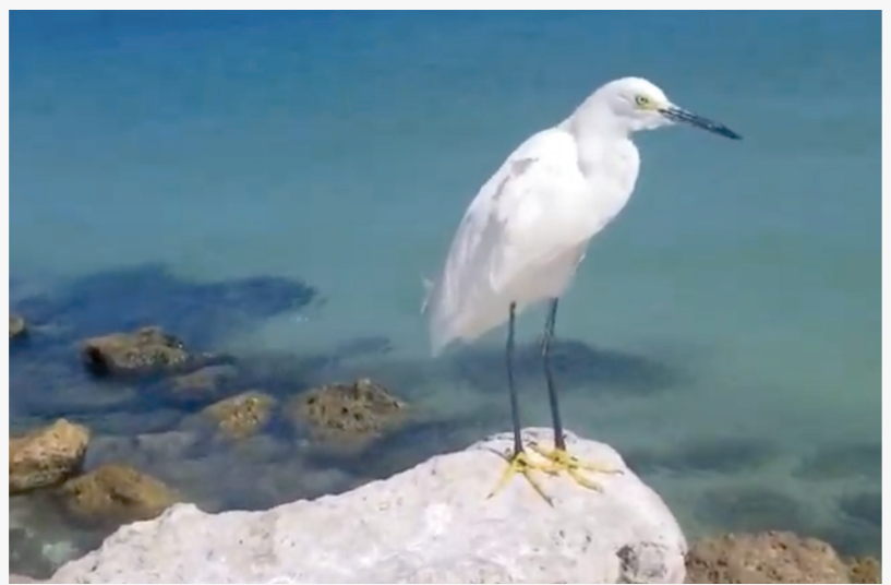
Still photo of the snowy white egret that started the unusual journey