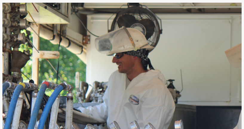
in situ groundwater remediation chemistries tackle chlorinated solvent and petroleum contamination

Environmental ("Cascade"), the leading field services contractor of drilling and remediation services, announces partnership with TEA , Inc. ("TEA") to tackle the most difficult phase of chlorinated solvents in groundwater, known as dense non-aqueous phase liquid (DNAPL).