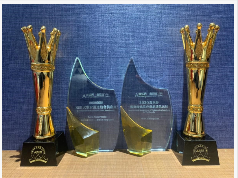
Golden Crown Awards3

The Asian market is increasingly important to the amusement industry, and Polin Waterparks has invested many years there, including extending its presence with the creation of an office in Shanghai. Since then, Polin Waterparks has installed some of the largest waterparks in China featuring the company's award-winning waterslides. As a result of these efforts, Polin Waterparks received its most recent accolades: the Golden Crown