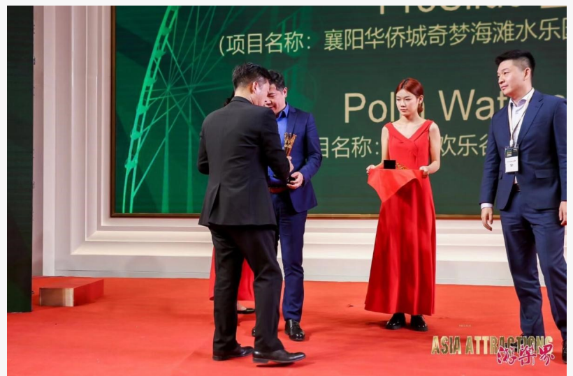
Golden Crown Awards2