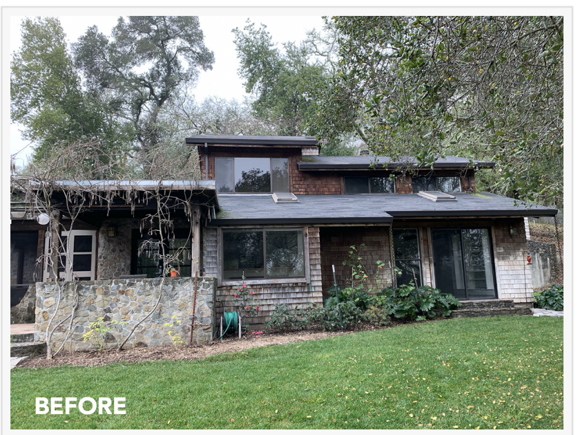
BEFORE image of the NARI Award-Winning Whole-House Remodel Project by LEFF Construction Design Build