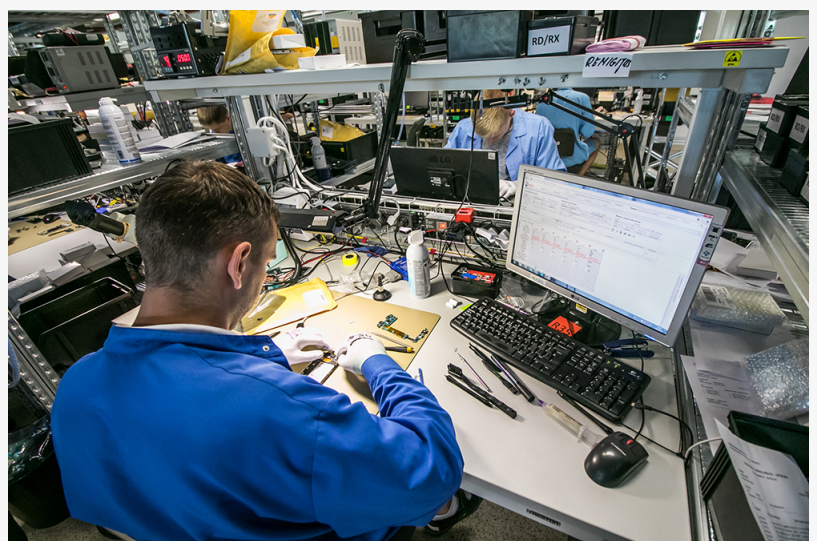
Wire Harness, PCB and Electronic Assembly Services

MEXICALI, BAJA CALIFORNIA, MEXICO, February 9, 2021 /EINPresswire.com/ -- This January Co-Production International (CPI) announced new In-House Contract Manufacturing capabilities available to manufacturers looking to start manufacturing in Mexico. CPI is a shelter company services provider with over 40 year's experience establishing Mexico manufacturing operations.