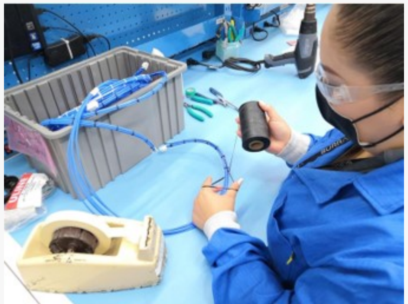
Cable wire harness manufacturing in Mexico