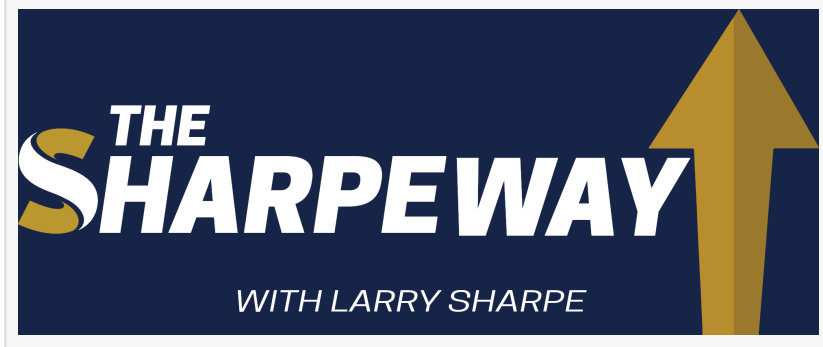
The Sharpe Way Podcast

This press release can be viewed online at: https://www.einpresswire.com/article/535361117