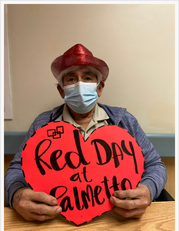
Patient at Palmetto Subacute Care Center in Miami, Florida wearing red attire on National Wear Red Day

The CareRite Centers network will also proudly offer complimentary virtual Zumba classes, heart healthy cooking demonstrations, painting courses, and exclusive Urban Zen Integrative Therapy sessions.