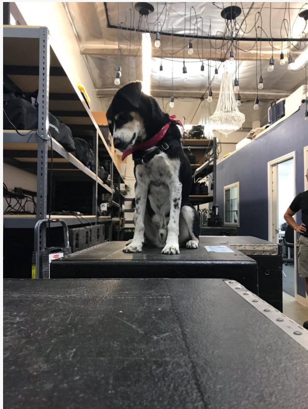
P.E.S. Mascot Buddy