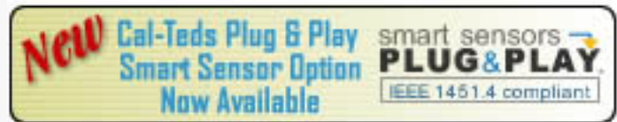
CAL-TEDS Plug & Play Smart Sensors Icon

Transducer Techniques, established in 1979, designs and manufactures a complete line of load cells, torque sensors, special purpose transducers and related instrumentation. Transducer Techniques load cells are uniquely designed for weight and force measurement in such diversified applications as process control and factory