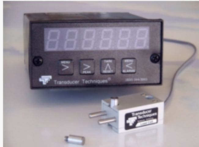
GSO Load Cell with DPM-3 Load Cell Meter