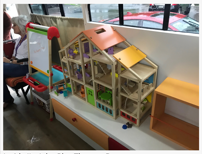
Inside 'Ivy' the Play Therapy Bus