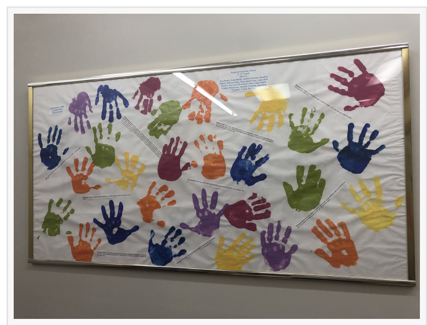
Playing with Colors

This press release can be viewed online at: https://www.einpresswire.com/article/535417355