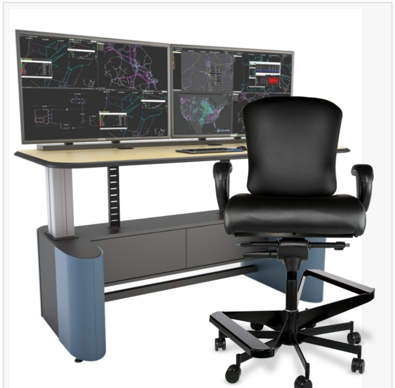
Mechdyne Synthesis All-in-One Control Console Solution

Developed in collaboration with RGB Spectrum and Tresco Industries LTD., Synthesis provides an affordable solution. All components are configured to provide practical functionality and optimal user experience. Synthesis brings the functionality of large, video wall control rooms to the desktop, without the video wall expense. In keeping with the times, Synthesis is a no-touch solution; Mechdyne installers are not required. Control room users and IT teams can easily assemble, connect, and configure Synthesis to operational status.