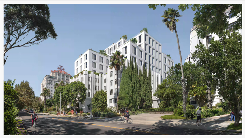
410 North Rossmore, Renderings by Brick Visual