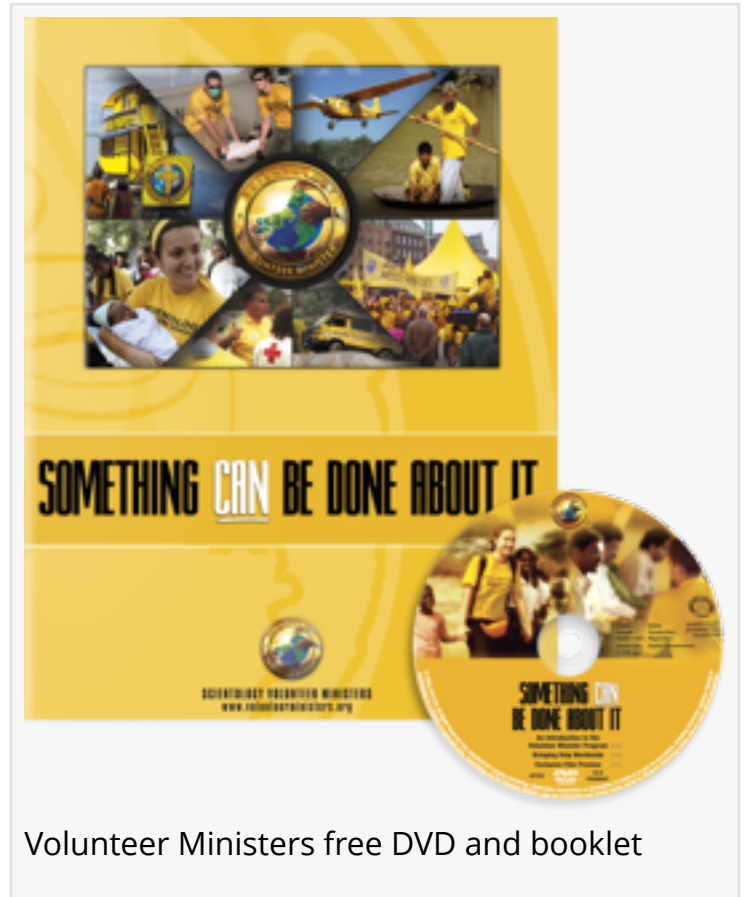
Volunteer Ministers free DVD and booklet

This course is based on the work of humanitarian and New York Times bestselling author L. Ron Hubbard , who developed these techniques after thousands of hours working with people. Mr. Hubbard found that the area of relationships and marriage was a common problem about which people sought advice.