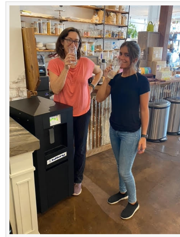
Green Pineapple Wellness

4. The Tiffany is part of a new generation of technical advances that significantly reduce the need for plastic bottles and help achieve a smaller carbon footprint. The use of individual reusable containers will reduce plastic bottle waste substantially.