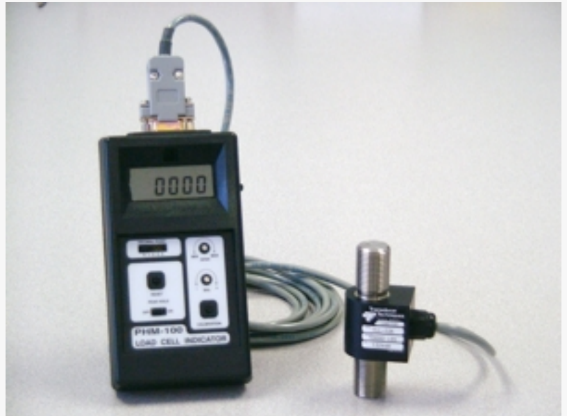
PHM 100 Hand Held Indicator and TLL Load Cell