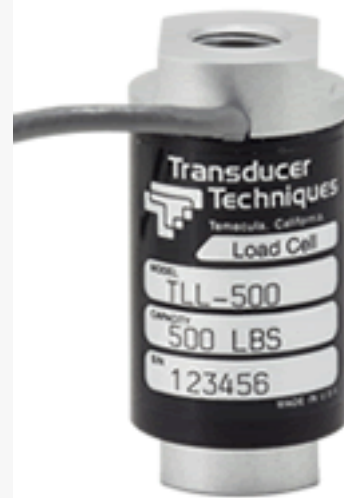
TLL Series Load Cell

An important asset of our load cells is their extremely small deflection. The maximum deflection