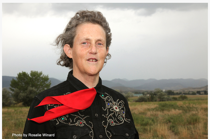
Temple Grandin, Ph.D., Prominent Author and Speaker on Autism

Held virtually on March 10th at 12:30 PM EST, Dr. Grandin will discuss the effects of the COVID-19 lockdown on people with Autism Spectrum Disorder, or ASD.