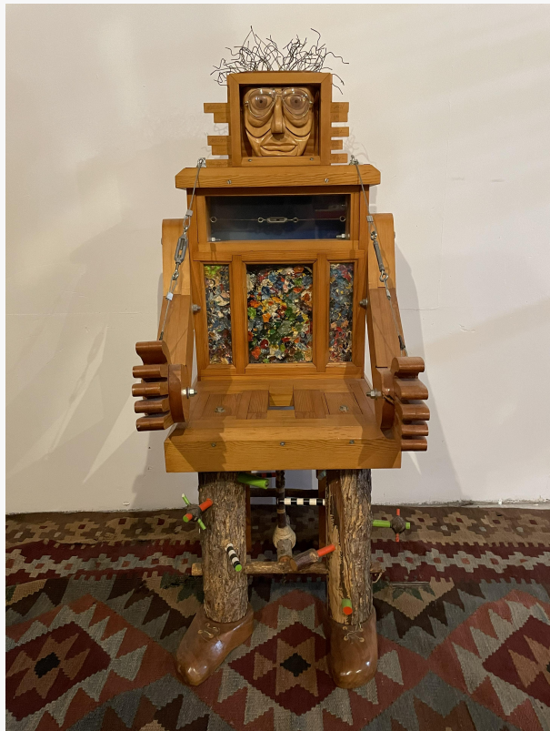
David Holmes, figural man folk art chair, signed, 44½ x 20 x 20in. Estimate $800-$1,200