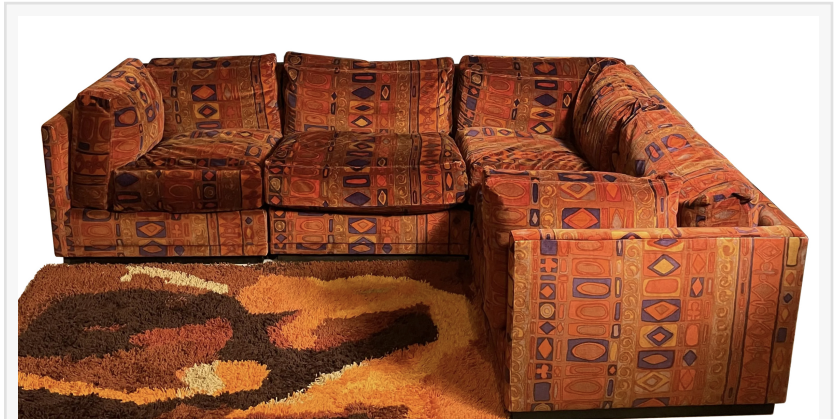
Jack Lenor Larsen (American, 1927-2020) for Directional, patterned sectional sofa, midcentury modern. Estimate $300-$500