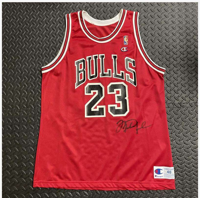
Michael Jordan double-signed Chicago Bulls jersey, size 48, made by Champion. Very fine condition. Estimate $1,000-$2,000

View full catalog online at: https://www.liveauctioneers.com/catalog/192998_shakedown-1979-mcm-folk-post-modern-design/