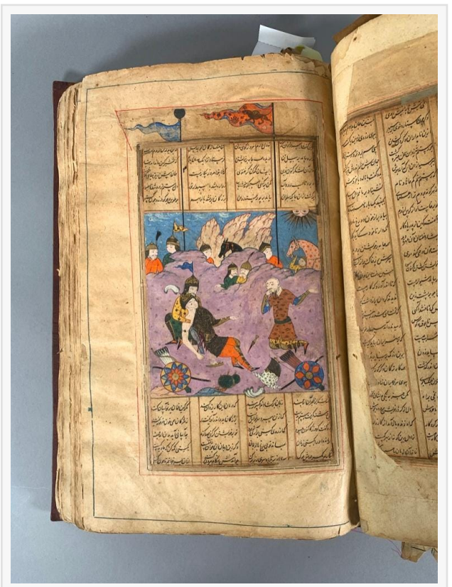
Shah-nameh (or Book of Kings, Iran's central literary work) is a 17th century bound Persian manuscript with 14 miniature paintings, depicting various court scenes (est. $1,000-$2,000).

The fine art category will feature an 18th century British School oil on canvas portrait of Reverend Thomas Walker in a heavy elaborate 42 inch by 36 inch frame, with a label inscription on verso (est. $2,000-$4,000); and an oil on canvas portrait of a young beauty executed in the manner of Henry Raeburn (British, 1756-1823), 29 ½ inches by 23 inches (sight, less frame), showing some old relining and heavy old varnish (est. $2,000-$4,000).