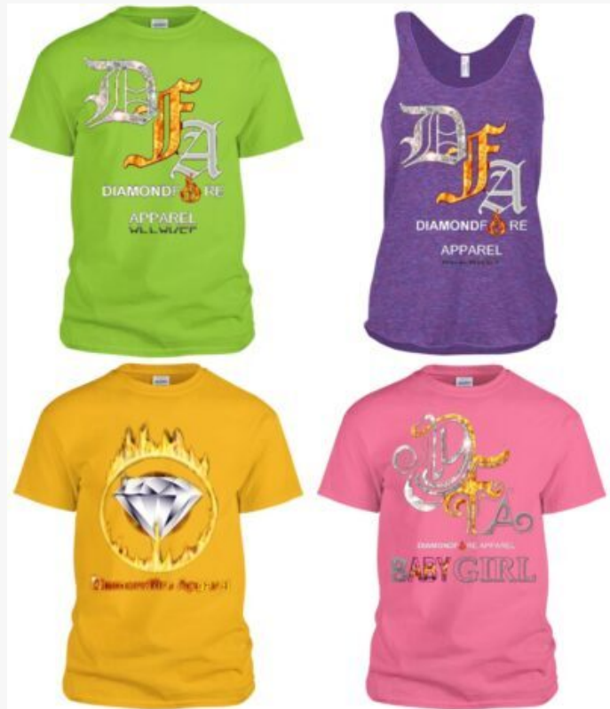
Fashion t-shirts High fashion t-shirts Diamondfire Apparel

Match made! When you need the perfect fashion t-shirt boutique spot to find just what you want and has the service you need at affordable prices you don't mind paying for #uniquefashion, there is Diamondfire Apparel boutique. These striking fashion t-shirt designs speak for themselves by accentuating your fashion features.