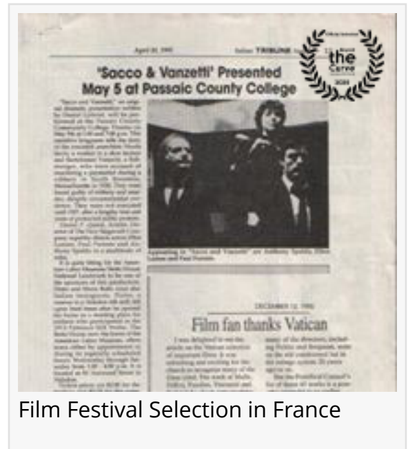
Film Festival Selection in France