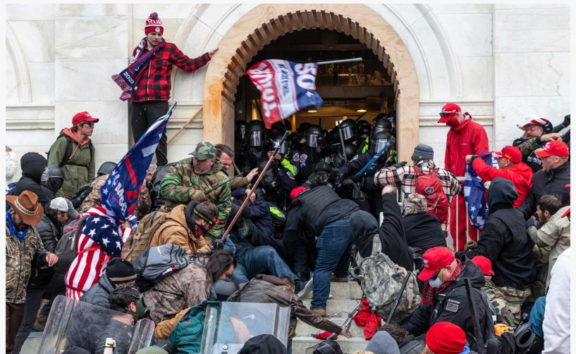
January 6, 2021 - A pro-Trump insurrectionist mob breaks into the Capitol building.