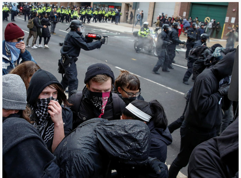
J20 Protests DC - Protesters demonstrating against U.S. President Donald Trump take cover as they are hit by pepper spray by police on the sidelines of the inauguration in Washington DC