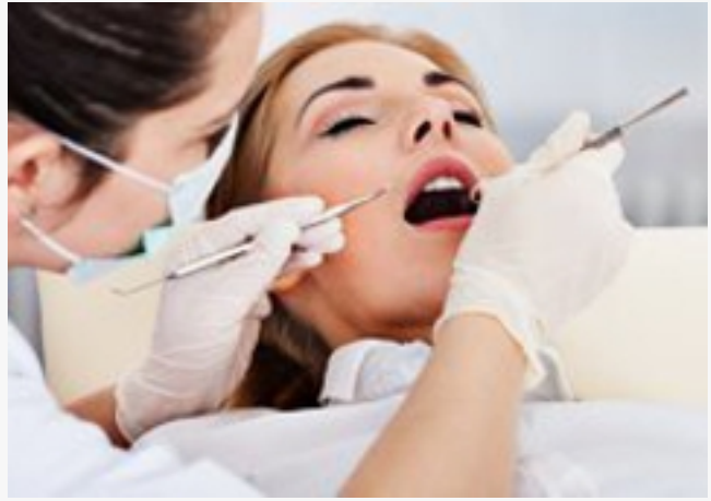
‘Best of State’ Dentist Holladay UTAH: Top for DENTURES