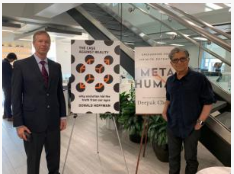
Dr. Deepak Chopra and Professor Don Hoffman