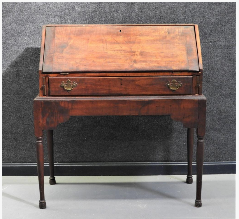
Rare, 18th century tiger maple drop-front desk on a stand, made in New England with a fitted country interior over one drawer over a separate base (est. $800-$1,200).

"The tiger maple desk on stand is a very interesting piece to me," said Travis Landry, a Bruneau & Co. auctioneer and the firm's Director of Pop Culture. "I would imagine it is not often seen in