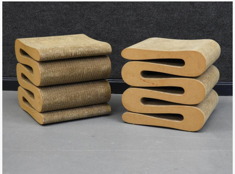
Pair of cardboard Wiggle Stools by the Canadian-born American architect Frank O. Gehry (b. 1920), part of the artist's 1972 "Easy Edges" series (est. $2,000-$3,000).