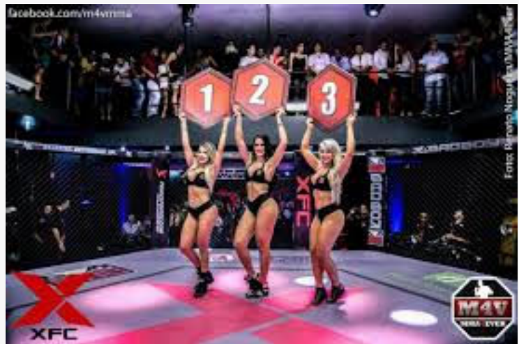
DKMR XFC Ring Girls