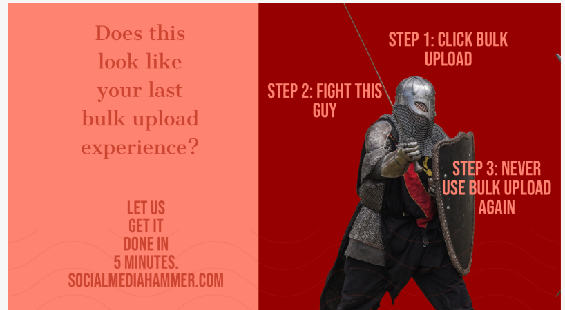
One of Social Media Hammer's Ads

This press release can be viewed online at: https://www.einpresswire.com/article/535535579