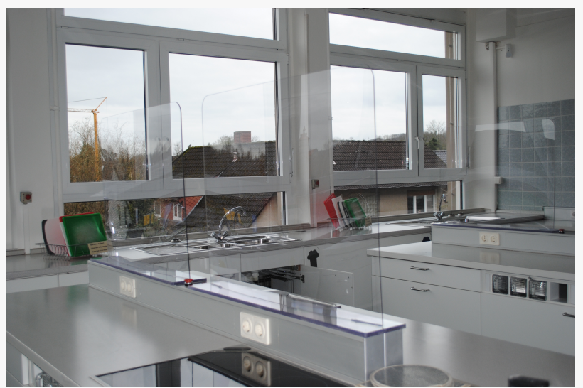
Sneeze Guard Shield for Schools

administration offices and school front desk or erect them between food service staff and students. Place them on teachers' desks for one-on-one student and parent meetings, and even use our shields to protect students from each other in situations that make distancing difficult for them. The polycarbonate substance we use in our Sneeze Guard shields does not hinder communication. This substance is lighter and more durable than glass but maintains glass-like transparency. Therefore, the only thing our barriers will stop is the transmission of