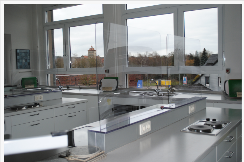
Sneeze Guard for Schools

We jumped at the opportunity to aid in the fight and are proud to say that we now offer an entire portfolio of stand-alone and hanging plexiglass barriers to shield against COVID-19. As of this writing, we have delivered shields to businesses and institutions of all types all over the continent. We believe that Solarplexius Sneeze Guard shields could greatly benefit your school by protecting those vital to its operations. You can easily install barriers in the