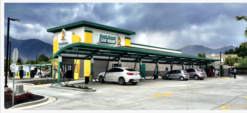
Free Vacuums for Customers

memberships starting at only $19.99 per month.