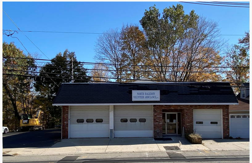
North Haledon Auction Dec 2020