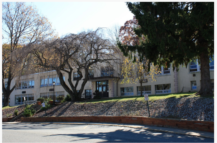
Hopatcong Auction 2021

The Former Ambulance Corps Headquarters in North Haledon, New Jersey is situated on Belmont Avenue. The building was previously utilized as a volunteer ambulance and fire company. Over fifty individuals registered for the online Auction which concluded on December 16th of last year. Over forty bids were placed and resulted in a high bid of $330,500. The Borough wanted it closed before the end of the year.