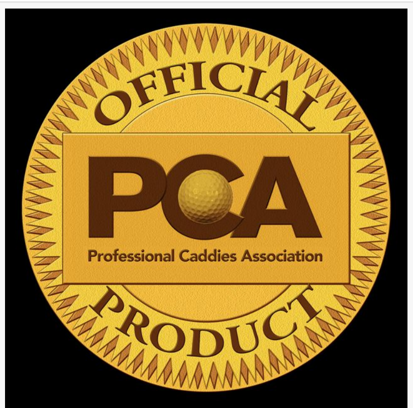
PCA PR & MARKETING world Caddie Team

is a not-for-profit 501 c (3) dedicated to changing the future of cancer by funding advanced,