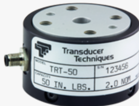
TRT Series Torque Sensor