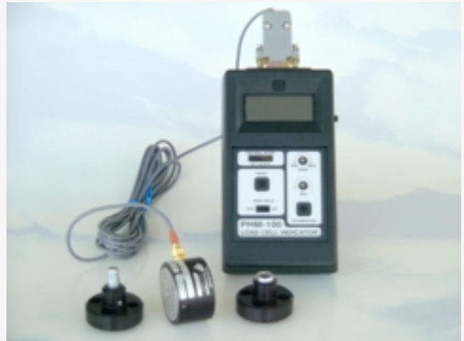
TRT Reaction Torque Sensor and PHM-100 Hand Held Transducer Indicator