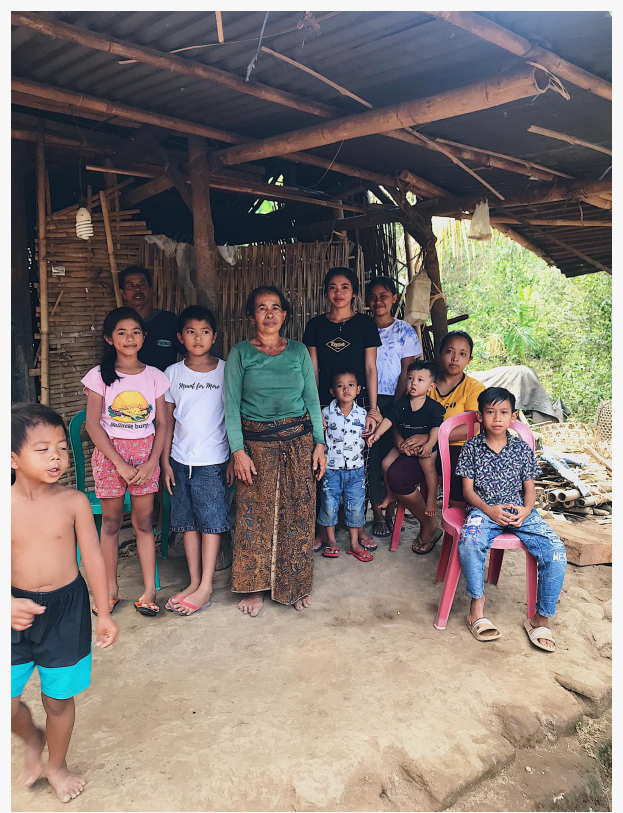
Villagers in Bali relying more and more on local charities to survive

Jonette Wilton Sunday Press Melbourne +61 403 680 571 jonette@sundaypress.com.au Visit us on social media: Facebook