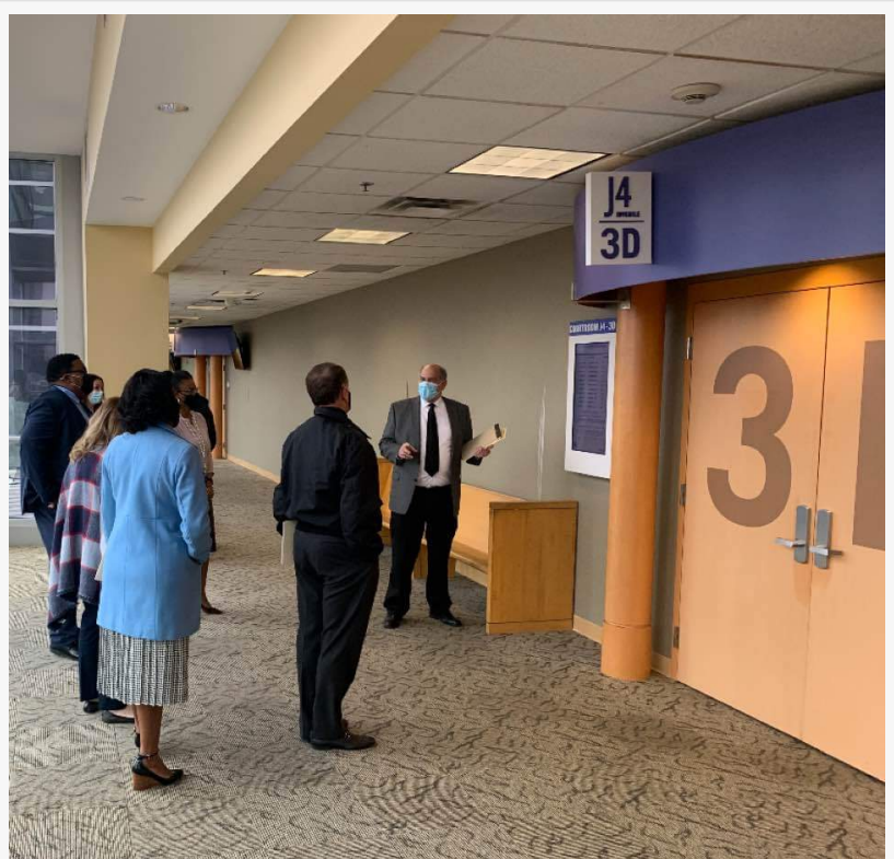
Fulton County Innovates with Navigo® Technology

This press release can be viewed online at: https://www.einpresswire.com/article/535586270