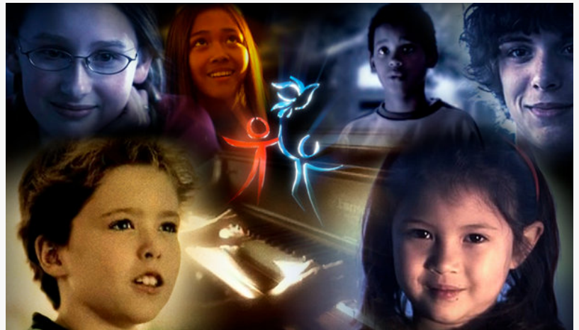
Youth for Human Rights International offers free materials as well as a free online course to educate students in basic human rights