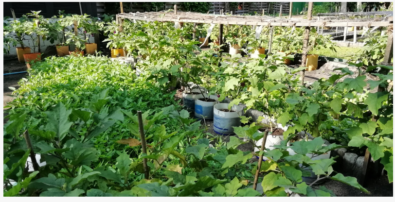
Organic Farm at Ellaidhoo Maldives by Cinnamon