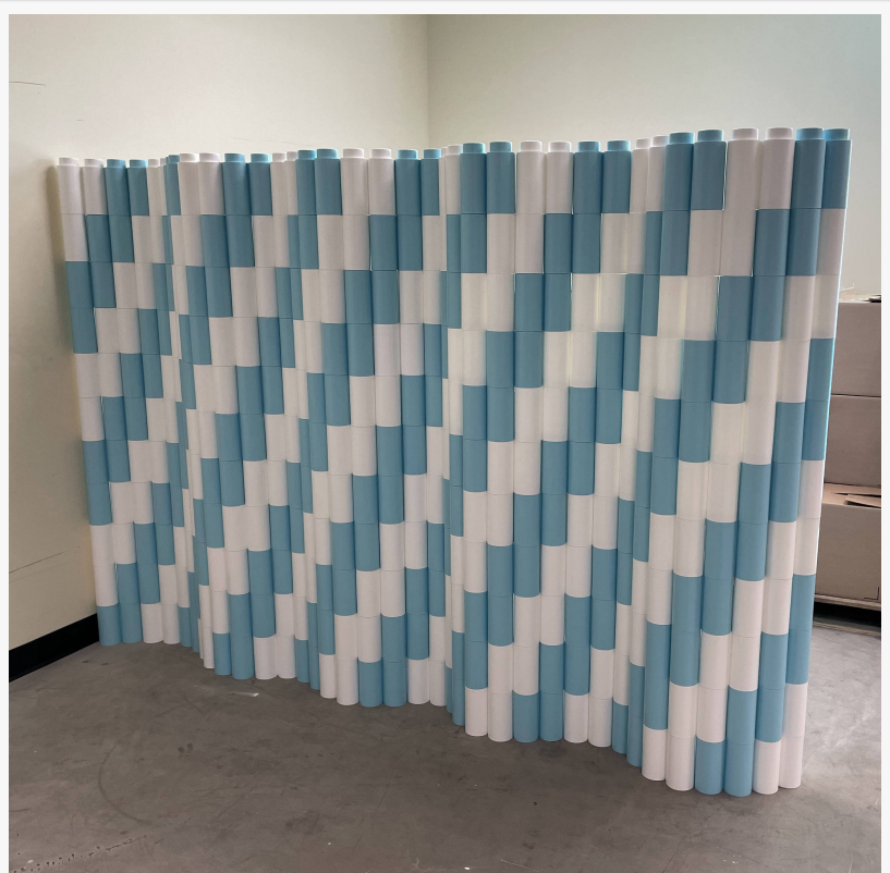
Cylinder-Shaped Modular Building Blocks to Build Wavy, Curved or Straight Walls