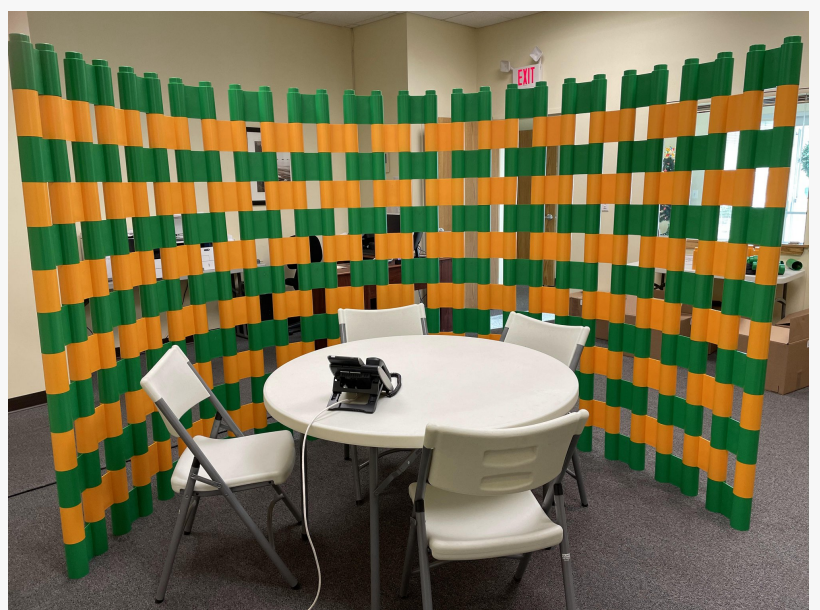
EverCurve Office Rounded Open-Wall

MINNEAPOLIS, MINNESOTA, UNITED STATES, February 18, 2021 /EINPresswire.com/ -- EverBlock, the leading manufacturer and provider of modular building systems has developed a unique cylinder-shaped building block system called, EverCurve. EverCurve consists of a series of interlocking tubular modules that connect to create walls, dividers, open partitions and other fun objects.