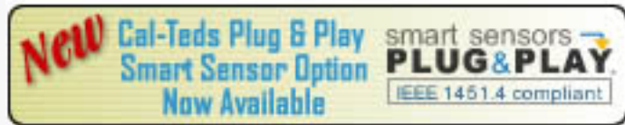
CAL-TEDS Plug & Play Smart Sensors Icon