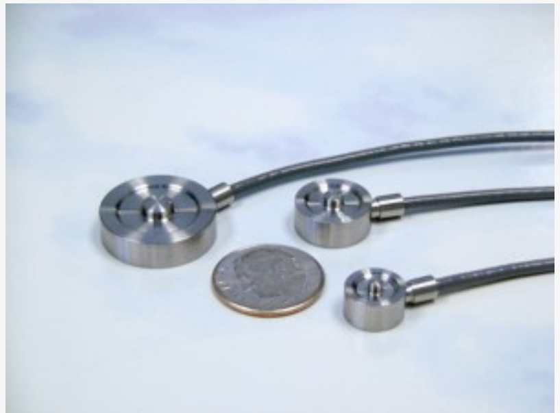
SLB Series Subminiature Load Cells