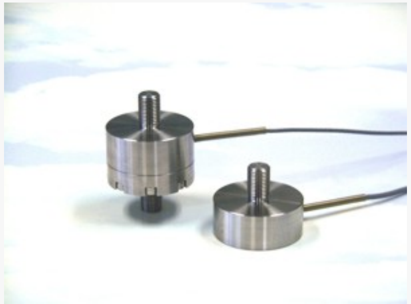
SSM and DSM Series Load Cells