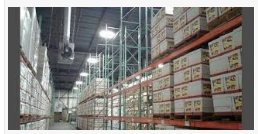
$GDMK Distribution Center