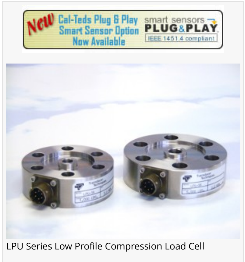
LPU Series Low Profile Compression Load Cell

/EINPresswire.com/ -- Our LPU Series Load Cell are a low profile, universal tension or compression pancake load cell type. They are available in 14 ranges from 100 lbs. through 50,000 lbs. Hold down bolt holes are provided through the outer diameter and a threaded hole provided through the center for pushing or pulling from either end. The LPU Series are made from 17-4ph heat treated stainless steel. The sensing element incorporates bonded foil strain gages of the highest quality to produce a full scale output of 3 mV/V. Accuracies are Nonlinearity 0.1%, Hysteresis 0.1%, and Nonrepeatability 0.05% or better. They are sealed for protection against most industrial environments and are supplied with a Load Cell Calibration Certificate traceable to N.I.S.T.