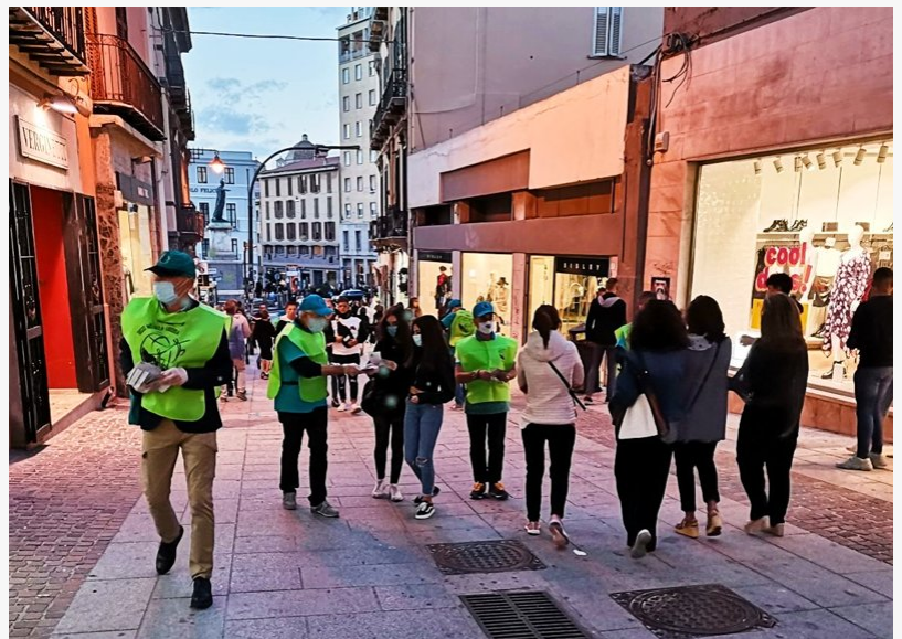
Drug-Free World volunteers from the Church of Scientology of Cagliari in the south of Sardinia spend a Saturday evening talking to young people and helping them make the self-determined decision not to use drugs.

Free Truth About Drugs E-courses are now available in 20 languages through the Drug-Free