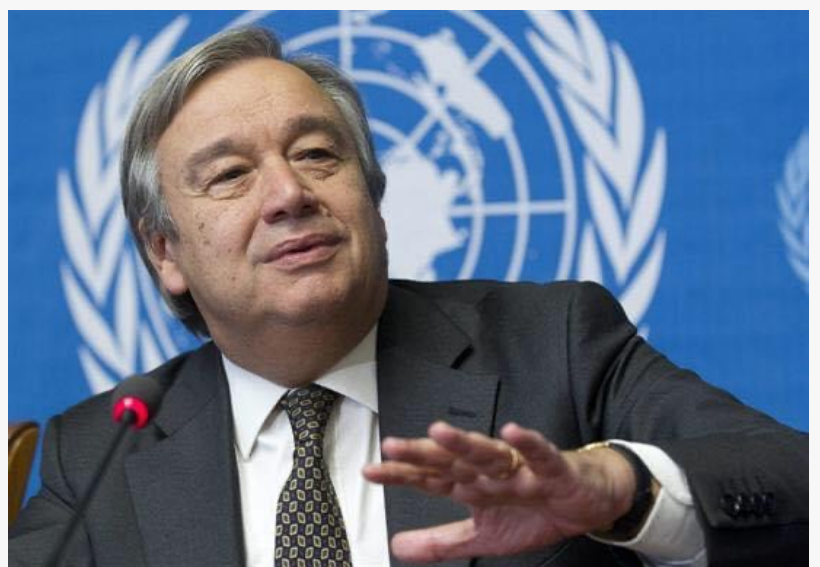
UN Secretary General António Guterres

WASHINGTON, DC, USA, February 20, 2021 /EINPresswire.com/ -- The Sindhi Foundation has a message for UN Secretary General António Guterres this International Mother Language Day, on February 21st. International Mother Language Day is a worldwide annual observance to promote the awareness of linguistic diversity and to highlight the importance of the right to education in one's own mother tongue.