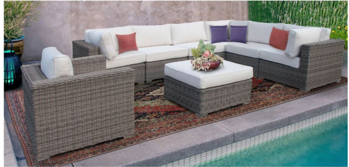
The Rockies - 8pc Sunbrella® Outdoor Patio Furniture

WESTMINSTER, COLORADO, USA, February 21, 2021 /EINPresswire.com/ -- Cozy Corner Patios (CCP), a small business aiming to become a trendsetter in the outdoor furniture space, is excited to announce the launch of its new product range through its e-commerce services platform. What started as a business among friends and associates has ushered in a unique opportunity for customers to find high-quality, affordable furniture from the convenience of their home. The team at CCP believe that luxurious outdoor furniture should be available to as many people as possible and that everyone should be given the opportunity to beautify their outdoor spaces with the furniture of their dreams.